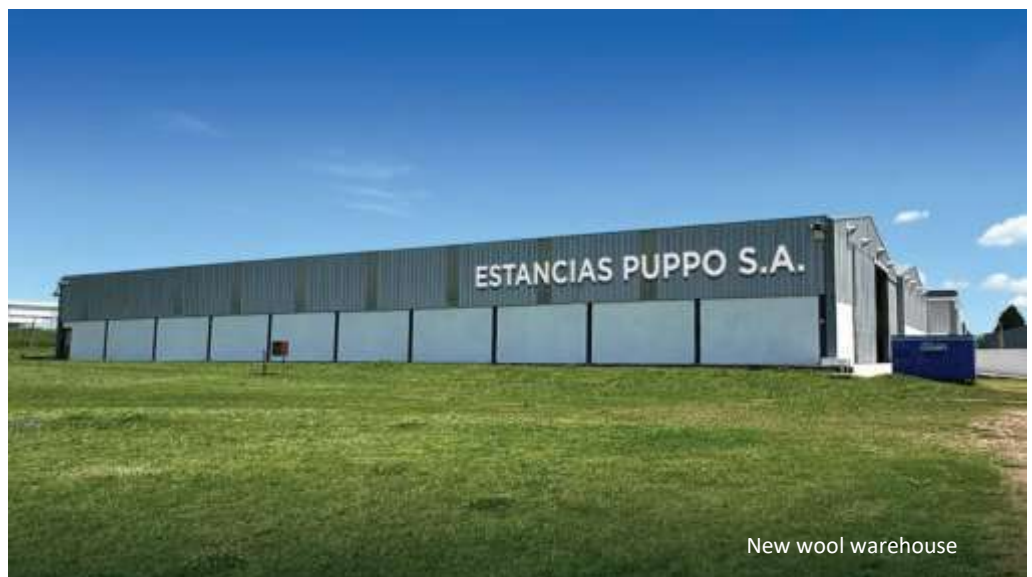
New wool warehouse

With a significant investment in its expansion, Estancias Puppo S.A. will begin working on a new 4,500-square-meter warehouse exclusively for greasy wool exports. This facility will feature cutting-edge technology, utilize clean energy across most processes, and will further develop the skills of its human resources.